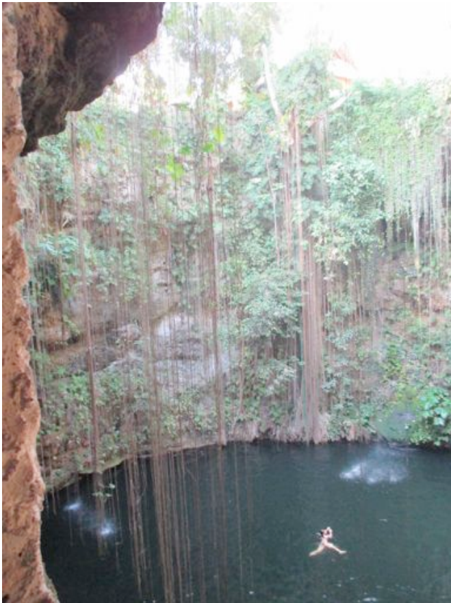
Cenote (sink hole), Yucatan Peninsula.