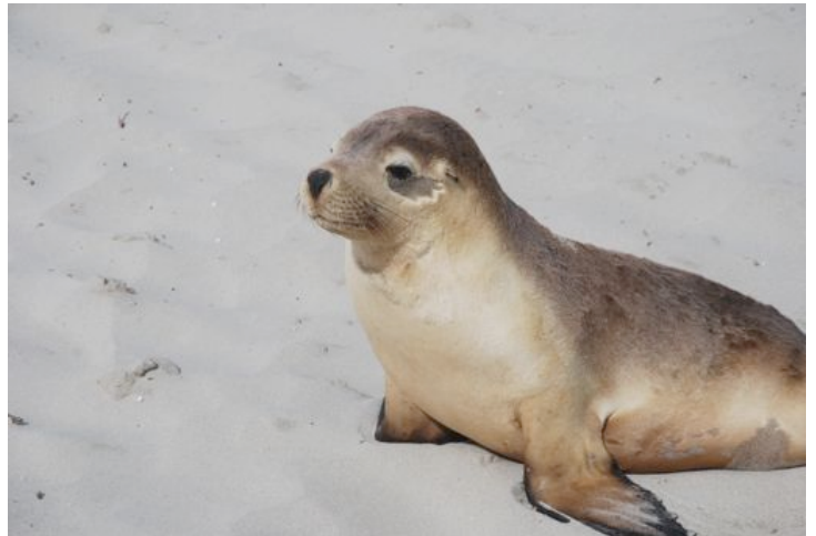
Sea lion, Seal Bay, Kangaroo Island, South Australia

Contact Inga directly to enquire about the workshop. Call 0403731570 or email inga@olvarwood.com.au . Contact Chris for information relating to tour details.